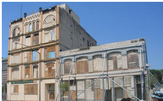
Buildings During Renovation

Eventually, all of the buildings on this block except the Vickrey/Brunswig Building and the Plaza House were demolished. These two buildings were retrofitted for earthquakes and renovated to become LA Plaza de Cultura y Artes, the Mexican American Museum. The renovation included restoring the exterior facades, including reconstructing the cornices, to match their original design.