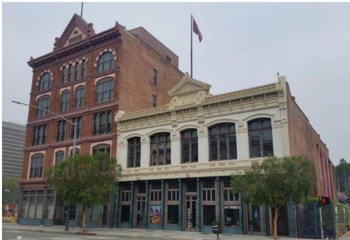
Vickrey/Brunswig Building and Plaza House