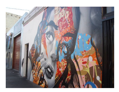
Many Murals decorate the Arts District