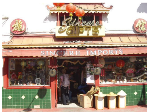
This shop owned by the same family for approx. 100 years.