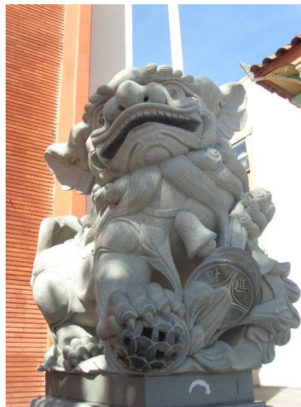
Lion Dog outside of one of the business associations. Area also contains many Asian banks.