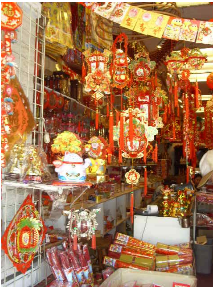
Shop with traditional ornaments, incense, etc.

In February my son called and suggested we go to Chinatown for dinner during the Chinese New Year celebration. To research events I went on the internet and found a great website www.chinatownla.com . The website contained several pages of history, events, shopping and dining information. There was also an invitation to join a 2.5 hour tour of Chinatown sponsored by the Chinese Business Improvement District (CBID). (Cost was $20 per person.)