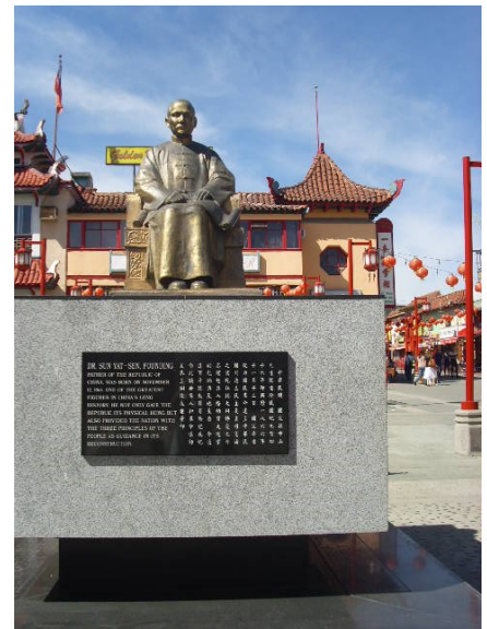
Statue of Dr. Sun Yat Sen in the Central Plaza